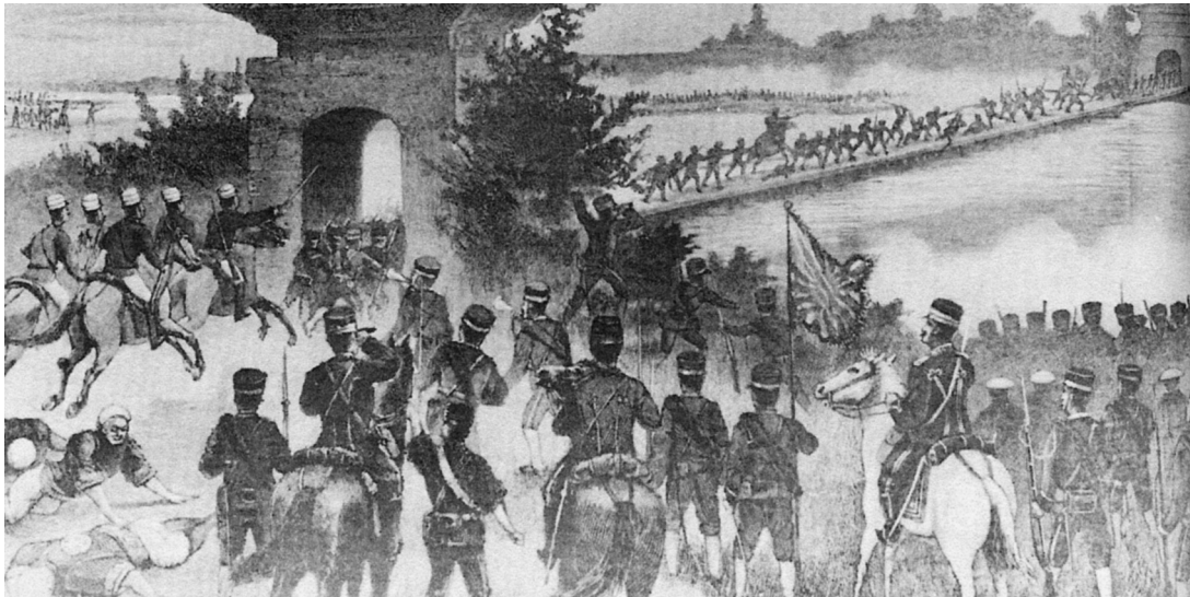
Japanese troops capturing Pyongyang in Korea during the war with China, 1894-95.